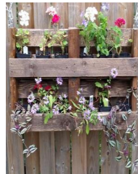
Half Pallet Planter (Indoor/Outdoor)