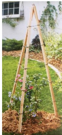
Tripod Trellis (Outdoor only)