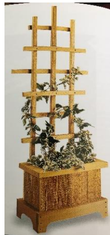
Container Trellis (Indoor/Outdoor) Different base