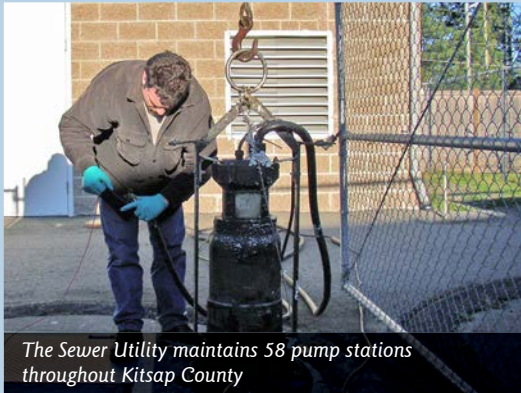
The Sewer Utility maintains 58 pump stations throughout Kitsap County