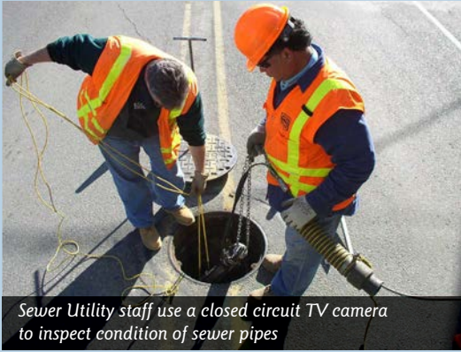
Sewer Utility staff use a closed circuit TV camera to inspect condition of sewer pipes

Kitsap County Public Works | Sewer Utility