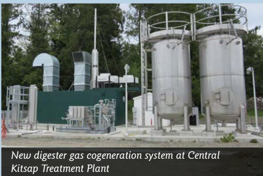
New digester gas cogeneration system at Central Kitsap Treatment Plant